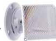
Universal Wall Bracket PN 1040-000