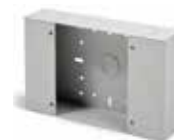
Back Box PN 1260-000