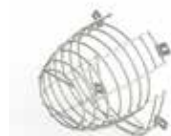
Protective Cage PN 1100-000