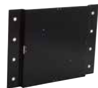
Prism Mount Plate PN 1030-000